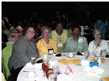
Our delegation at the UTO Dinner